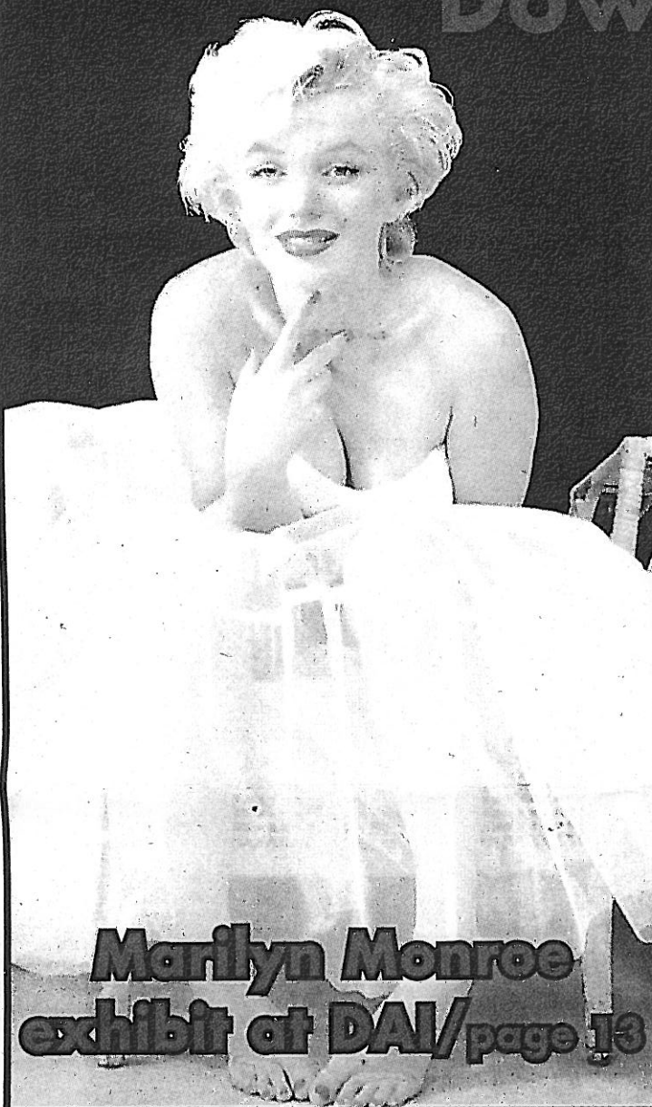
Marilyn Monroe exhibit at DAI/page 13